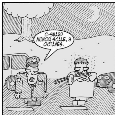
The new sobriety tests are tough.