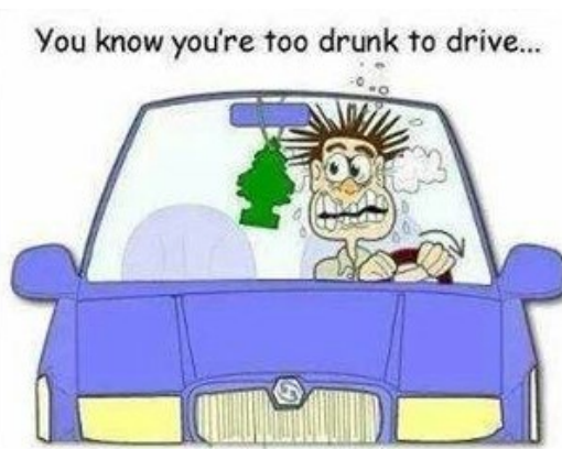
When the tree you swerve to miss is actually your air freshener