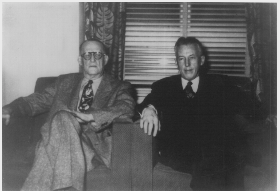
Bill W. carried the message of recovery to Dr. Bob.