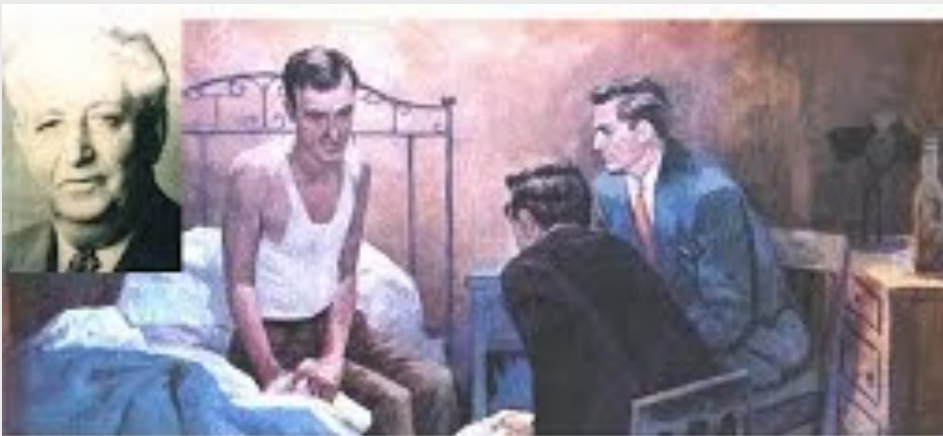
Bill W. & Dr. Bob carried the message of recovery to Bill D. Commonly referred to as, "The Man on the Bed".

In 2021 G.S.O. estimated A.A.'s worldwide membership to be close to 2 million.